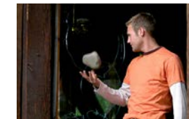
Vandalism & civil unrest