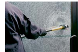
Break-ins and smash & grab